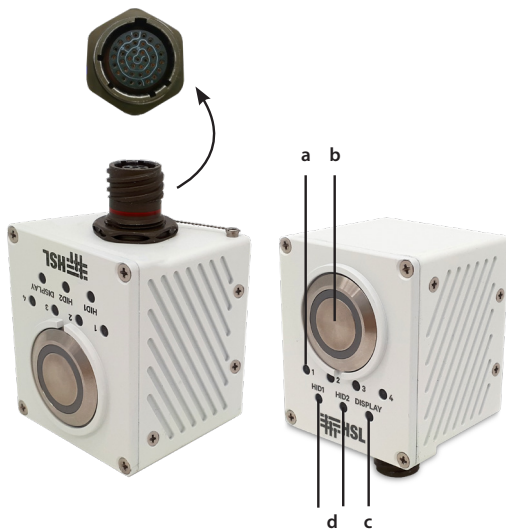
Remote control - WR40-4TR