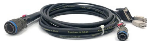
Rugged Product Cable Sample