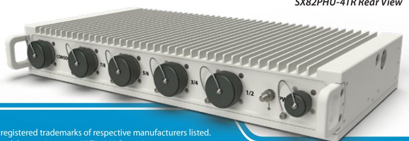
SX82PHU-4TR Rear View

Receive the unit's operational readiness status and diagnostics via RS232. BIT results are reported upon startup, on demand and continuously every 5 minutes.