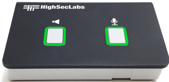
Secure / Safe to Talk (Default)

A green LED, by default, indicates that the audio is closed (safe). When pressing the device button, the peripheral device connects for 10 minutes, and the LED changes to red (unsafe). A minute before the audio switches off, the LED around the button flickers as a warning. The user can then extend that time with a long press on the button.