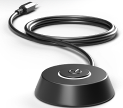
USB Data On/Off Button

The High Sec Labs' USB-C extended docking solution combines a local docking solution for USB-C computers and laptops with a remote extension of video, HID and USB 2.0 signals. This solution is especially suited for executive offices and meeting rooms where a local docking solution connects with peripherals such as soundbars, videobars, cameras and displays located at a distance from the docking station.