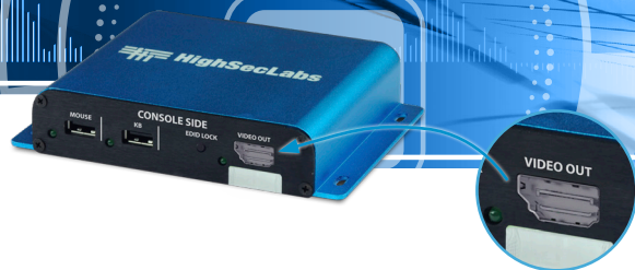
DP/HDMI DUAL CONNECTOR

sensitive computers. The Isolator is designed to provide the highest possible computer & peripheral isolation as demanded by government agencies, military, financial institutions and similar security sensitive customers.