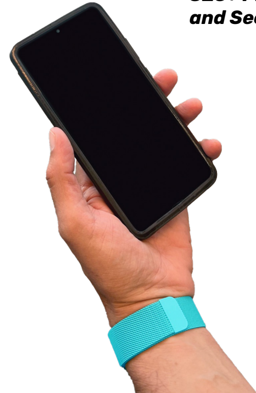
Modified S23+ Phone and Secure Jacket

Babylon is the only smartphone solution in the market that cannot be hacked by known and unknown cyber attack tools and spyware.