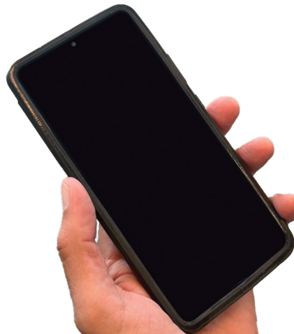
Modified Phones S10/S20 and Secure Jacket

Babylon is the only smart-phone solution in the market that cannot be hacked by known and unknown Cyber Attack tools and Spyware.