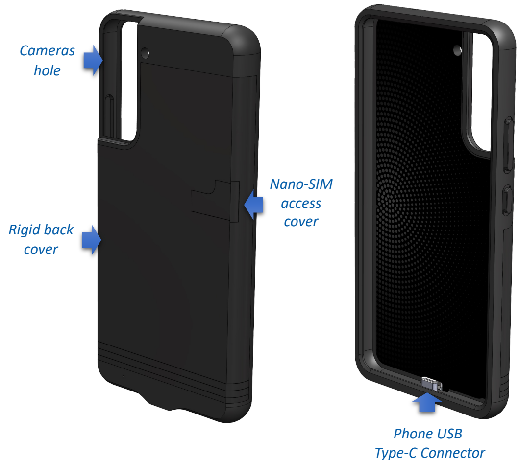
S22 Security Jacket