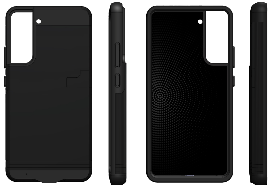
S22 Security Jacket