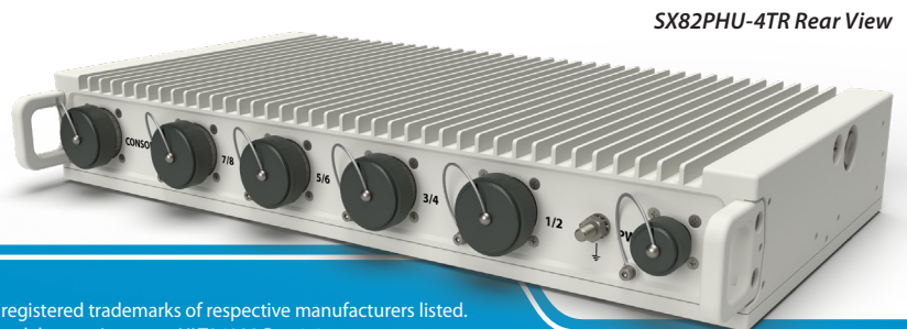
SX82PHU-4TR Rear View

Receive the unit's operational readiness status and diagnostics via RS232. BIT results are reported upon startup, on demand and continuously every 5 minutes.