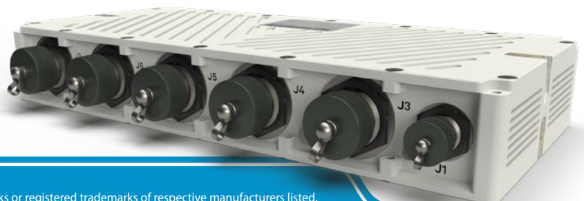
Secure SK41D-4TR Rear View

Receive status and diagnostics via RS232 regarding the unit's operational readiness. BIT results are reported upon startup, on demand and continuously every 5 minutes.