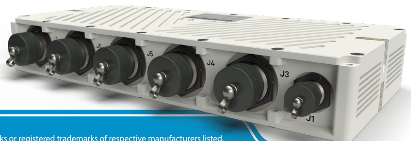
Secure SK41D-4TR Rear View

Receive status and diagnostics via RS232 regarding the unit's operational readiness. BIT results are reported upon startup, on demand and continuously every 5 minutes.